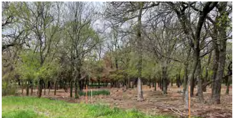
Denton County has spent an estimated $107,925 on maintenance on the historic Black cemetery and more than 52 hours of employee time since January 2023..

St. John Cemetery is located at Hub Clark Rd, Pilot Point, TX 76258.