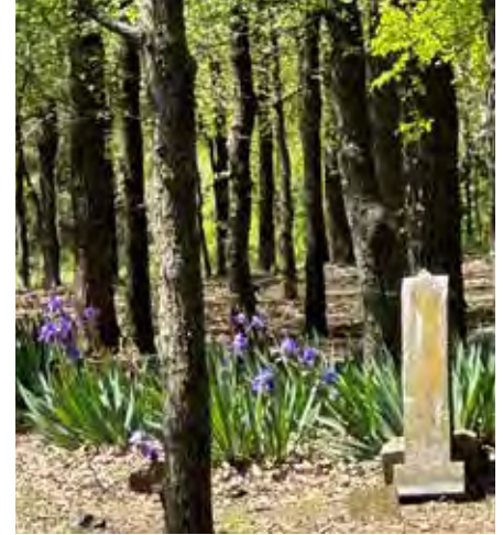
depicts the St. John Cemetery near Pilot Point, which has been maintained by Denton County since 2016.