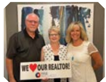
The Wiersemas sold property in Valley View