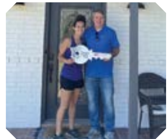
Carneys dreams come true with purchase in Gunter