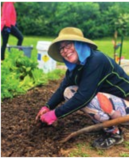
continued from page 7