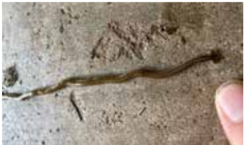
Mosquitos and Ewe!