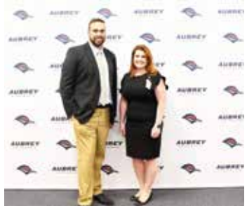
Fuller Elementary Hires Assistant Principal