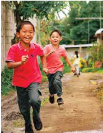
Exercising in Texas Summer Heat