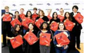
The Aubrey ISD Band Programs Ended School Year on High Note