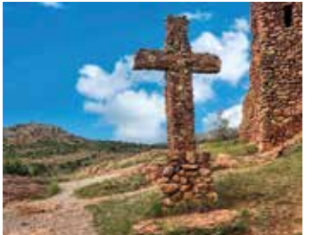
Area Church Directory