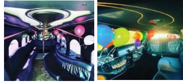
Everyday is a celebration with Lone Star SUV & Limo LLC!