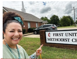
Free, fun programs for kids can be found at the First United Church. They have a Fine arts programs that has dancing, acting, music and art!