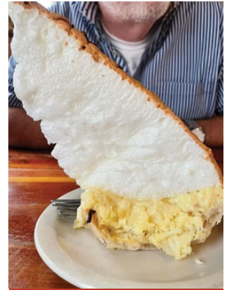
Pilot Point Guide visited Clark's Outpost Bar-B-Q for a slice of their mile high meringue coconut cream pie!