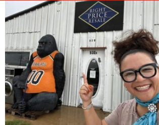
Right Price Resale has your appliances at a price you will love.