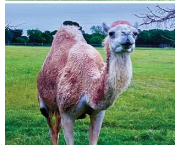
It's always a beautiful day to visit the camels at Sharkarosa Wildlife Ranch!