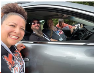
The new Meals on Wheels team is out delivering lunch to Pilot Point's seniors. The Meals on Wheels team hearts Pilot Point!