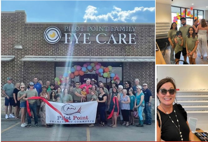
In July, 380Guide and Pilot Point Guide attended Pilot Point Family Eye Care's Open House and Ribbon Cutting. Welcome to Pilot Point!!

Send Us Your Photos to info@380Guide.com