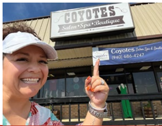
Coyote's not only has amazing spa and beauty services but also an amazing boutique with unique clothes, shoes and accessories.