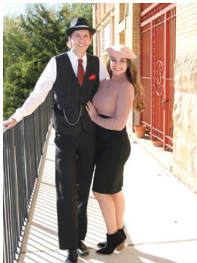
ON THE COVER:

Bonnie and Clyde Days.